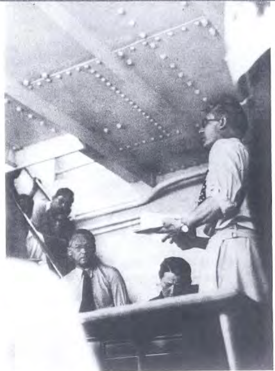
Left to right: Giedion, Helena Syrkus, Le Corbusier.