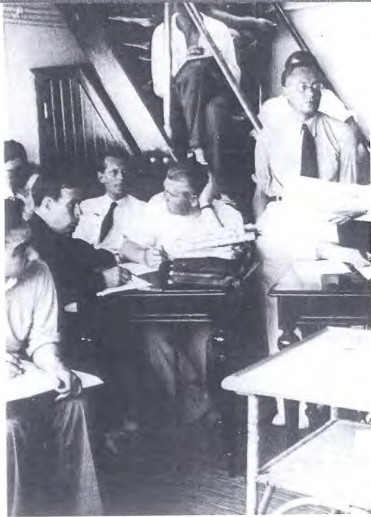
Meeting on board Patris II. Foreground, left to right: Bardi, Sert, van Eesteren, Giedion.